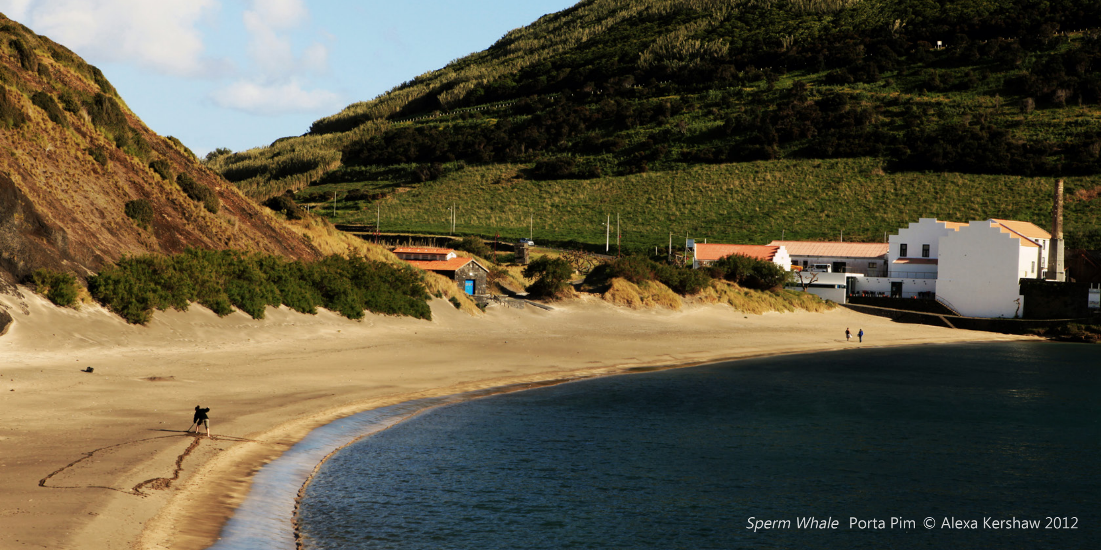
Sperm Whale Ponta Pim