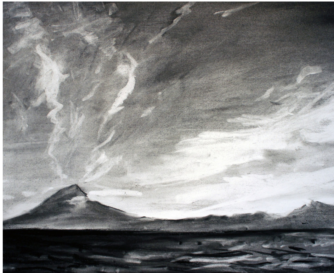
Pico Island 2012