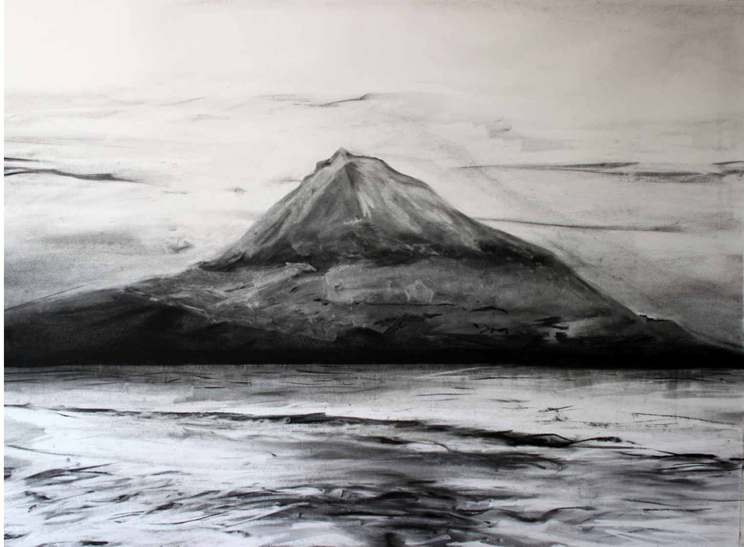
Sunset '12 Charcoal on Paper 2012