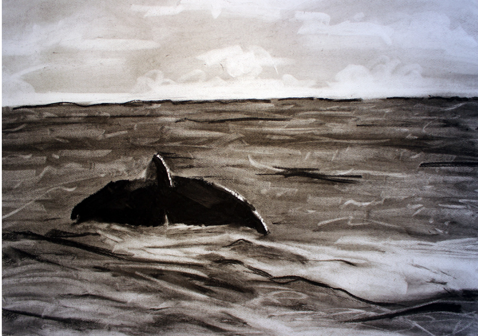
Sperm Whale Charcoal on Paper 2012