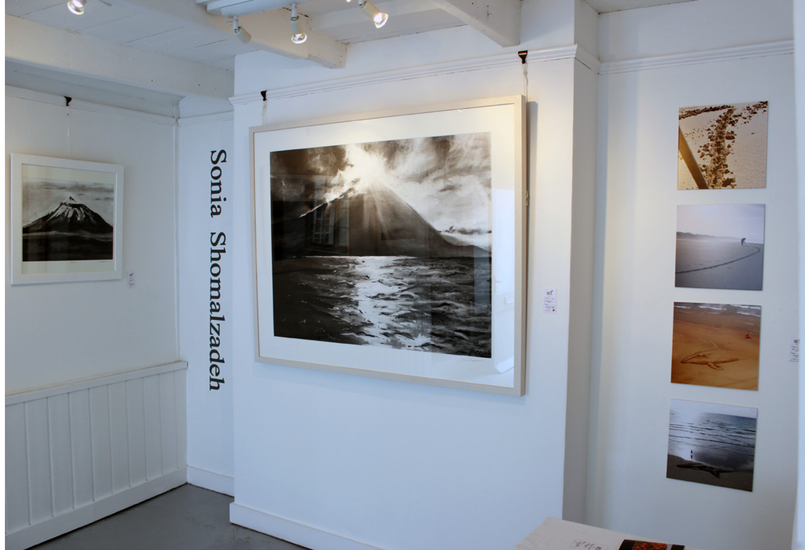
Exhibition Pydar Gallery, Cornwall 2012