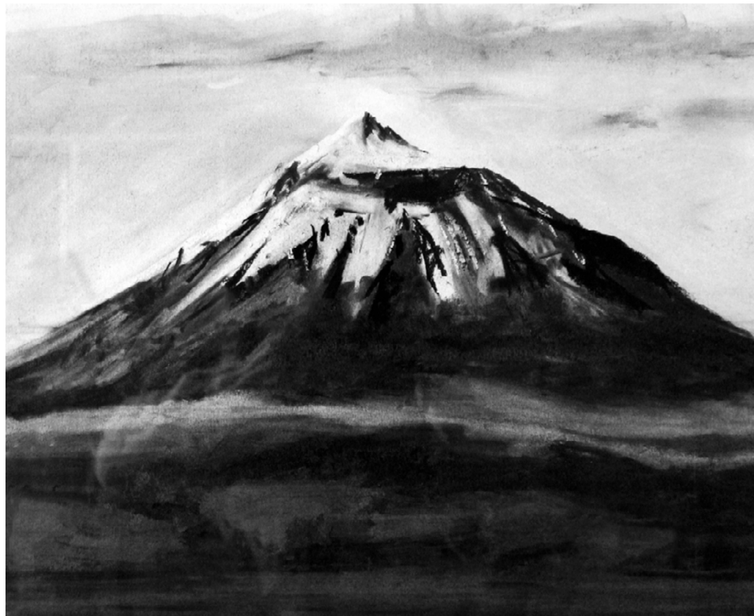
Snowy Pico 2012