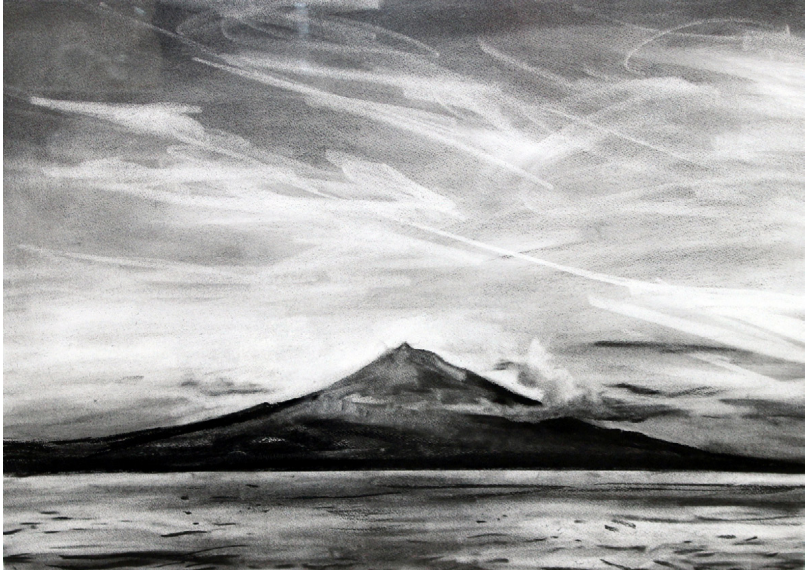
Big Sky 22nd April Charcoal on Paper 2012