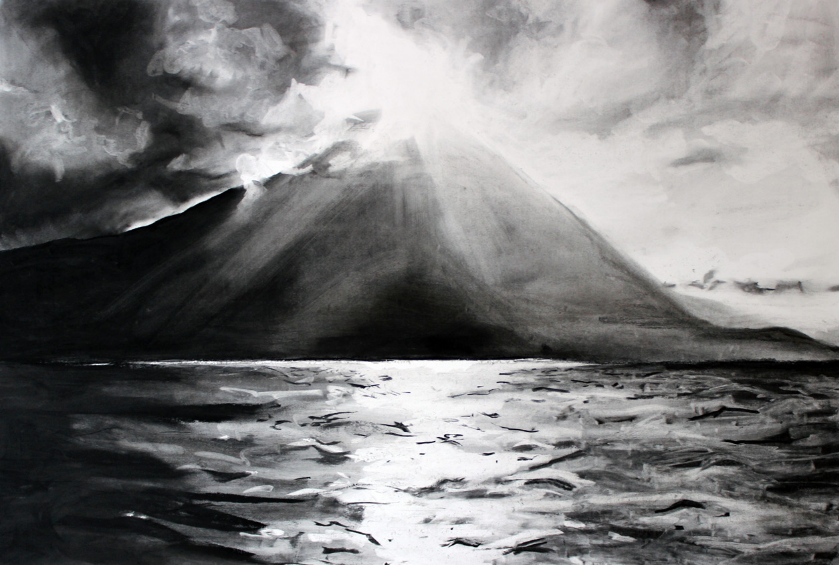
Pico '12 Charcoal on Paper 2012