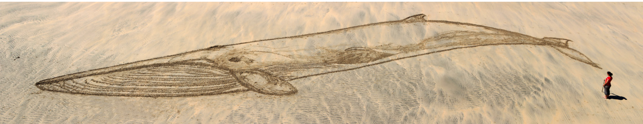
Fin Whale Gwithian 12th May 2012