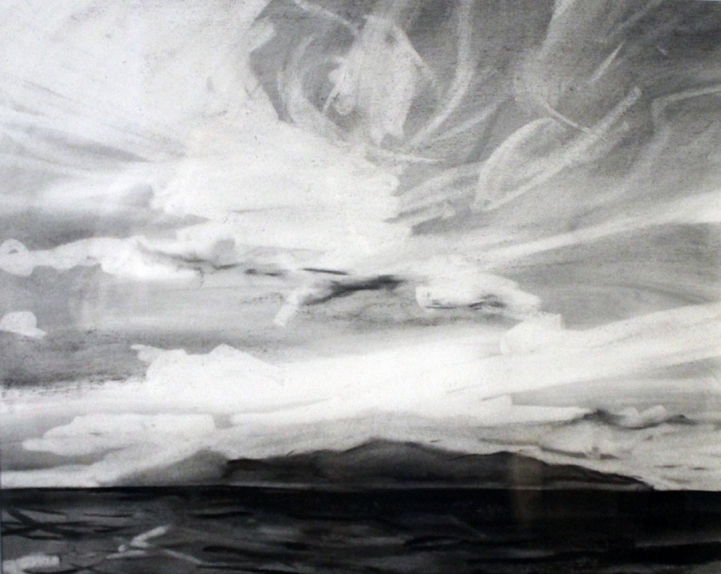
Sao Jorge Charcoal on Paper 2012