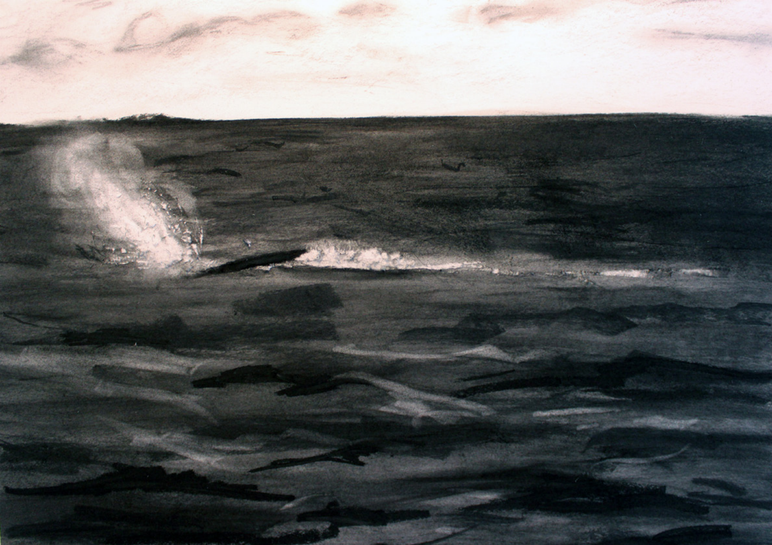
BLOW! Charcoal on Paper 2012