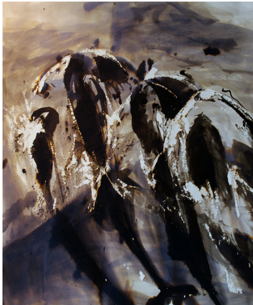
Pilot Whales Ink on Paper 2012