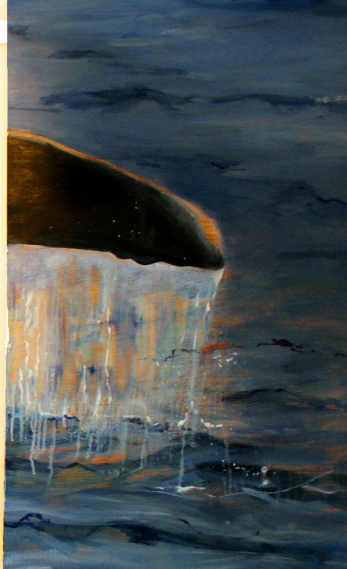
Tail Oil on Board 2012